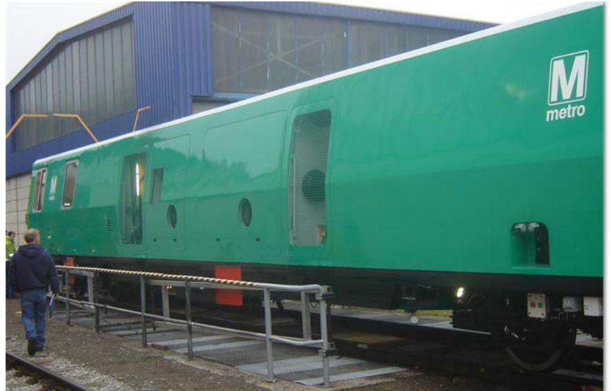
Rail vehicle with installed rail flaw detection system

Provides real-time assessment of wheel flaws.