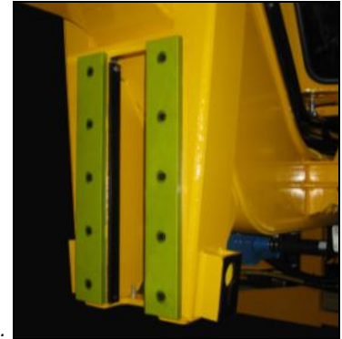
98760295 Workhead Wearpad Upgrade Kit installed on TRIPP frame.