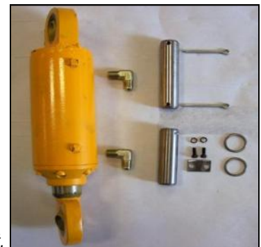
JX68297-KIT Squeeze Cylinder Kit.

Kit includes one JX68297 SQUEEZE CYLINDER, and quantity 2 of JC5405X6 90 DEG. MALE ELBOW and JZ682674 SQUEEZE CYLINDER SPACER. Also includes installation hardware.