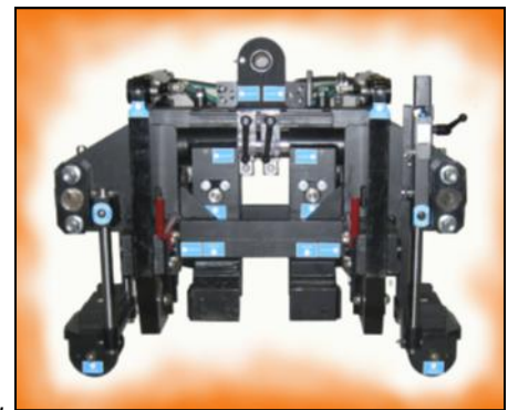
90650025 AA2R Main Workhead Exchange.