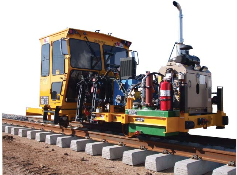
NSCA - Spring Clip Applicator

Easily set workheads for different rail heights, base widths & hole locations.