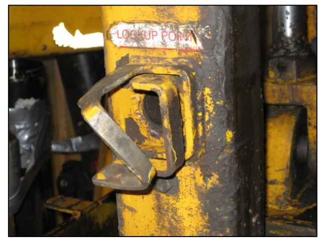
Figure 2 Damaged Lock Pin Retainer