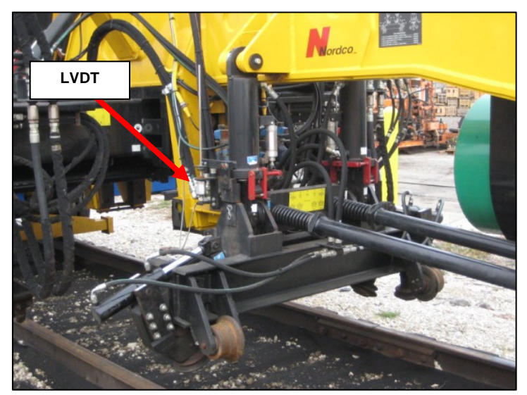
Figure 1 TRIPP Rail Lifter Assembly