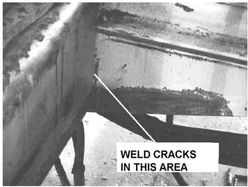
Area of cracked welds

A repair kit, part number 98410032, consisting of four gussets and installation instructions, is available at no charge to repair and reinforce these joints. To order a repair kit, please contact the NORDCO Service Department at 1-800-445-9258. You must provide the machine serial number to receive the kit. Please note that installation of the kit is the responsibility of the customer.