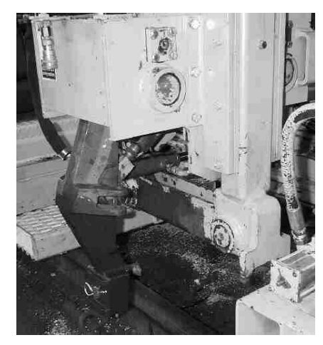
Figure 1 Original Design Cross

Please contact your NORDCO Representative or the NORDCO Parts Department for pricing and availability.