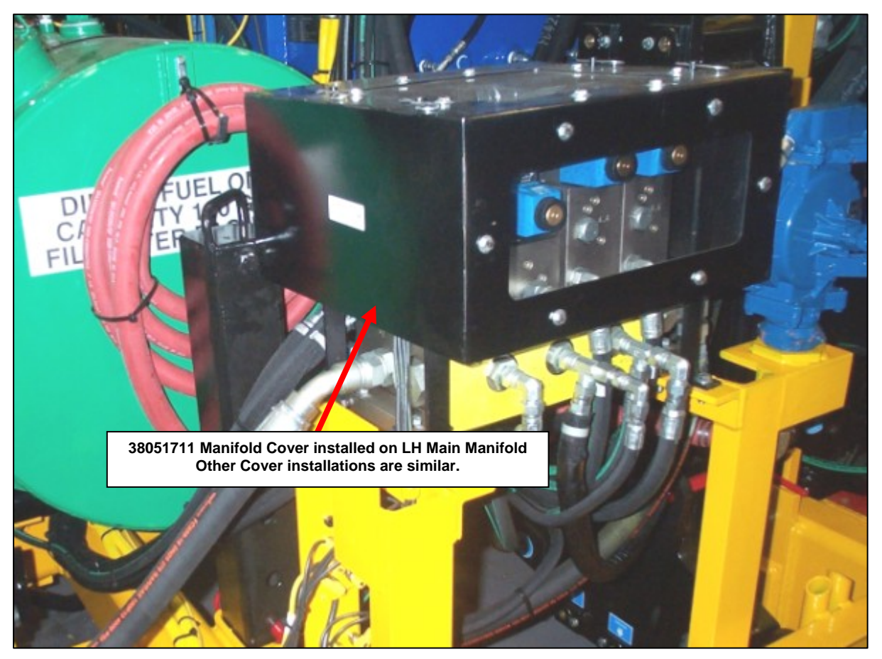
Figure 1 Typical Manifold Cover Installation