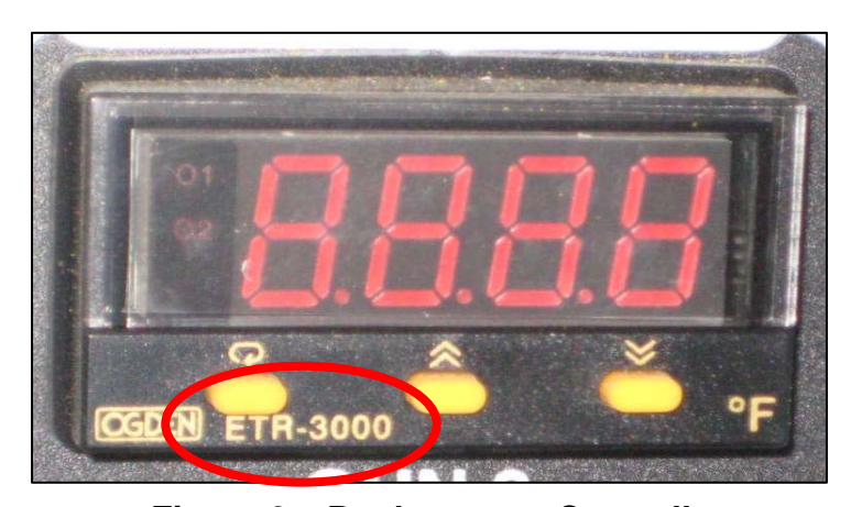
Figure 2 – Replacement Controller Replacement ETR-3000 Temperature Controller – 26605123 NOTE: Make sure to connect the white wire to terminal #9 when installing this controller.