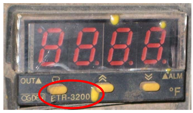
Figure 1- Original Controller Original ETR-3200 Temperature Controller – 26605120 NOTE: The white wire is connected to terminal #11 on this controller.