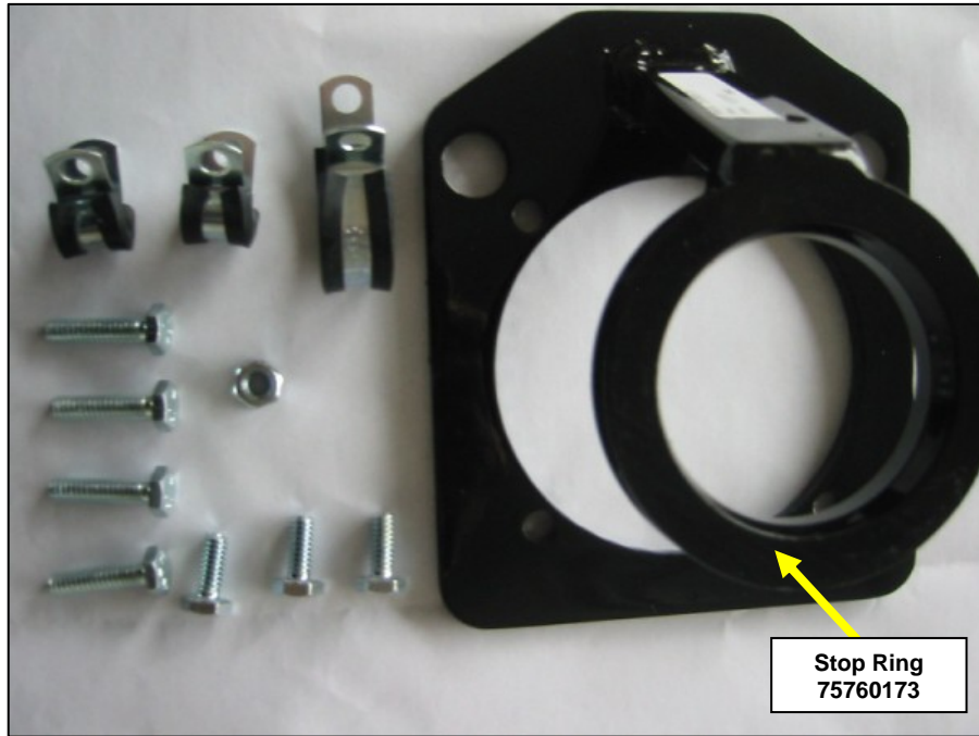
Figure 1 Components of Kit 98760035