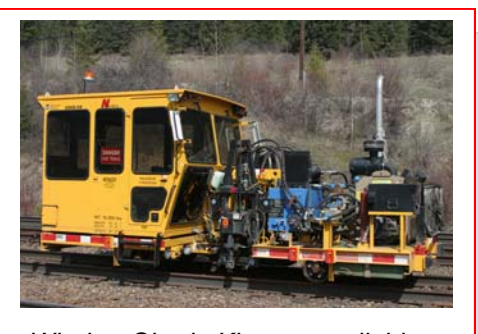
Window Shade Kits are available for the Nordco SP2R Dual Rail Spike Puller and other machines.