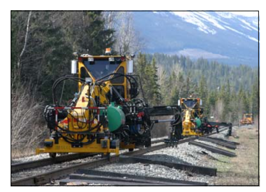
Nordco TRIPP Machine