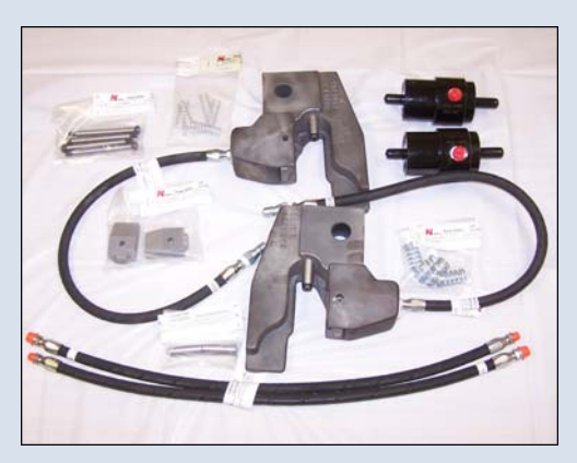
The BAAM Basic Package, one of 21 Nordco Maintenance-of-Way Machine Spare Parts Packages.

Nordco makes it easy to know which parts to keep on hand for your machine by offering Spare Parts Packages for all of our major machine types. Order the entire package to make sure you have a complete set of key components available, or use the list of parts as a guide to help you determine what you require for your inventory. To find the correct package for your specific machine, visit our website at www.nordco.com and go to Parts . Then click on Spare Parts Packages . Printable literature is available that lists all the parts included in each package.