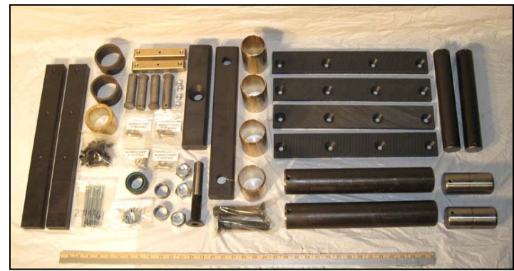
98350135 Evergrip Screw Spike & Standard Workhead Service Kit.

Bushing; 18227711 Upper Guide Block; 18227717 Lower Guide Block; 3004071 Hex Nut; 2798651 Flat Capscrew. <u>Includes 2 ea</u>: 71528112 Bronze Wear Bar; 54268110 Toggle Slide Pin; 54268518 Claw Lever Shaft; 22052252 Steel Claw Lever Bushing; 76340077 Roller Frame Pad; 54268479 Roller Pin; 2798632 Flat Capscrew; 63880321 Tubular Pulley Spacer. <u>Includes 3 ea</u>. 3042037 Hex Locknut; <u>4 ea</u>. 76340078 Housing Wear Pad; 22129950 Claw Housing Bushing; <u>16 ea</u>. 2796811 Capscrew.