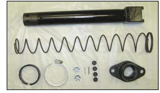
98410456 Standard Anvil Sleeve Kit.