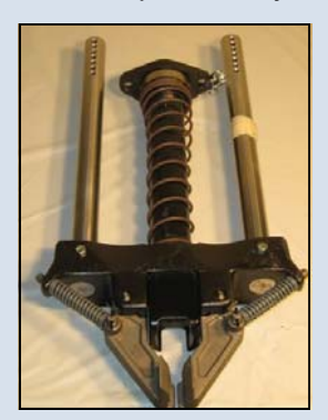
Jaw Mounting Kit with Sleeve.

Jaw Mounting Kits reduce machine downtime by making replacement fast and easy in the field or shop. Kits are available for the CX Hammer, Model C Spiker and 99C Spiker. Go to the Parts Page on www.nordco.com and click on Search for Repair or Upgrade Kit for a complete list of Jaw Mounting and other kits. Or, contact Nordco Parts to find the kit that is right for your machine and application.