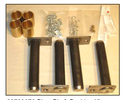
98760076 Pivot Pin & Bushing Kit.