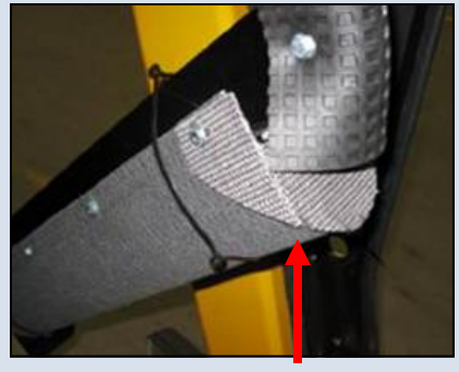
98410256 Spike Tray Dust End Cap attaches to the original Dust Chute. 98410257 is a complete Dust Chute & End Cap assembly.

98410257 Spike Tray Dust Chute with End Cap Kit expands the original Dust Chute 98410220 by adding the End Cap.