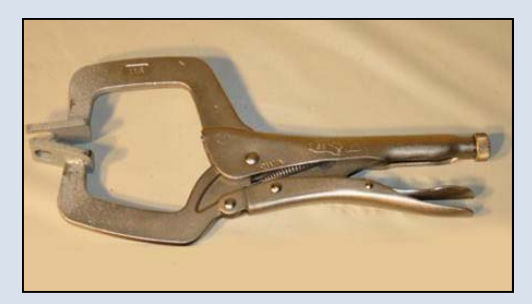
81380010 Jaw Spring Compression Tool.

This tool, similar to a vice grip, is specifically designed to compress and lock into place the compression style jaw spring, making it possible to change out the jaws on a Nordco CX Hammer, Model C Spiker. CGS Curve Gang Spiker, SS – Small Spiker, and older