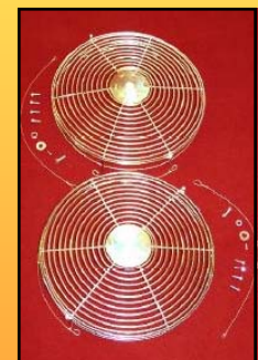
A/C Dual Condenser Guard Kit.