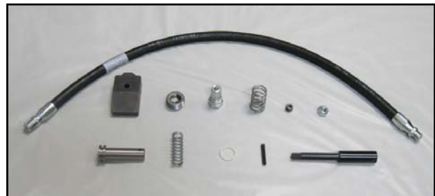
98690037 Anchor Holder Maintenance Kit.