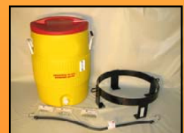
Drinking Water Cooler Assembly.