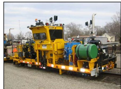
Nordco BAAM Anchor Applicator.

For a complete list of machine kits, go to Parts at www.nordco.com and click on Search for Repair and Upgrade Kits.