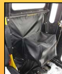
Spike Tray Opening Black Curtain Kit.