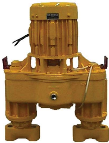
JV68336-02EX: Electromatic Vibrator