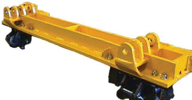
J0-2201685-2-01: Rebuilt Roller Clamp Assembly Complete