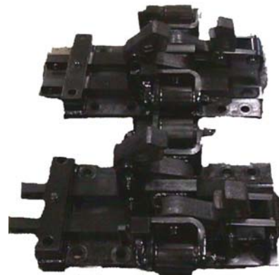
JW683484LEX: Exchange Rail Clamp Assembly (Left)