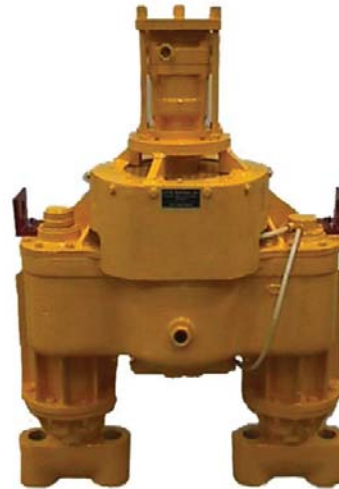
JE-2010512-0-02EX: Hydraulic Vibrator with Motor and Coupler