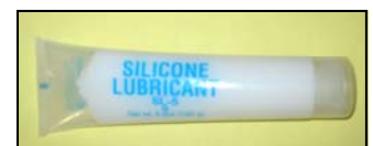
4806250 DIELECTRIC GREASE