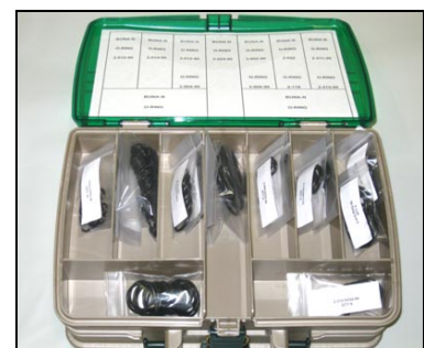
96430635, 98760009 O-RING KITS

96430635 MANIFOLD O-RING KIT: For Model C, M3 & Hydra-Hammer.