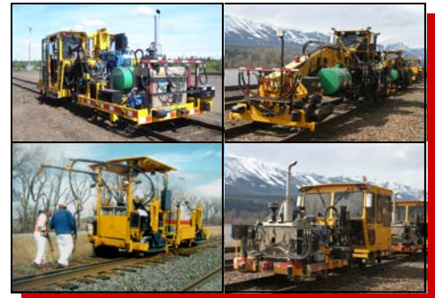
Nordco Maintenance-of-Way Machinery

This Troubleshooting Tool & Service Parts list includes many helpful items used to diagnose and correct situations encountered when servicing and maintaining Nordco Maintenance-of-Way Machines. For more information on diagnostic tools, service parts and repair and upgrade kits for your machine, contact Nordco Parts Sales and Service by phone, email, or via our website.