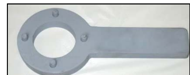
4011560 KENT HAMMER SPANNER WRENCH

98410385 KENT HAMMER SEAL KIT: For 28560610 Kent KB1G Hammer.