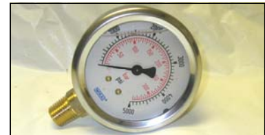
7017110 PRESSURE GAUGE

7017110 PRESSURE GAUGE: Standard test gauge, 0 - 5000 PSI.