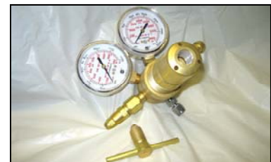
7020105 PRESSURE REGULATOR

81380010 JAW SPRING COMPRESSION TOOL: Used to change out jaw on CX Hammer, Model C and older retrofitted machines.