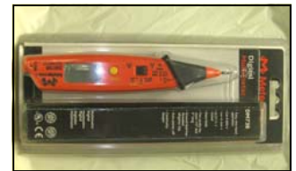
7078070 DIGITAL HAND VOLT, OHM METER