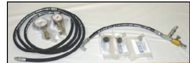
98410014 KENT HAMMER CHARGE KIT

98410014 KENT HAMMER CHARGE KIT: For 28560610 Kent Hammer (Requires 7020105 Regulator).