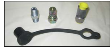
10280600 QUICK COUPLING ASSY.

10280600 QUICK COUPLING ADAPTER ASSEMBLY: Female Parker to male Stauff. Used on multiple older machines.