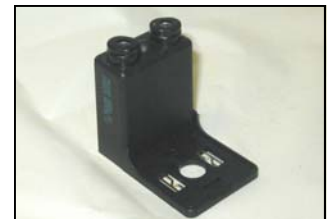
5120750 DIN TEST ADAPTER

4806250 DIELECTRIC GREASE: For electrical connections on all machines.