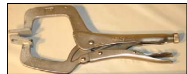
81380010 JAW SPRING COMPRESSION TOOL

4011560 KENT HAMMER SPANNER WRENCH: For removing Diaphragm. Used with CX Hammer, Curve Gang Spiker, SS Spiker.